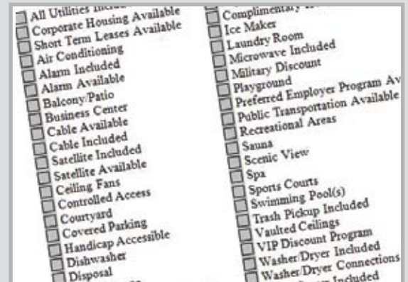
Easy exchange of data between your leasing team and the ILS providers