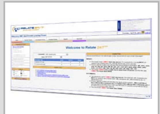
Campaign series of scheduled, strategically designed messages sent automatically