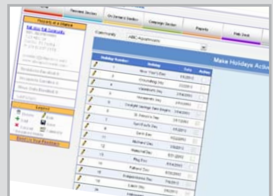
Increase ROI with Relate 24/7 SM 's automated rent reminders