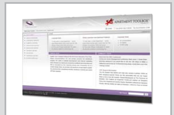
Instant presentation of company notices and news