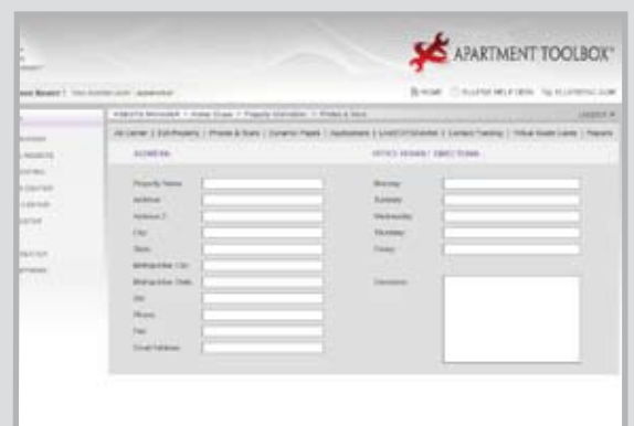
Easily update the dynamic areas of your website