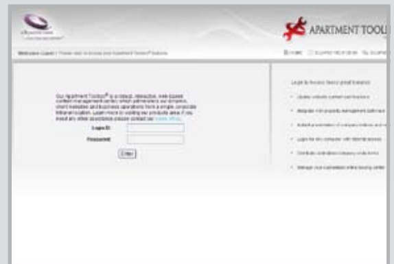
Secure: Customized Login Screen